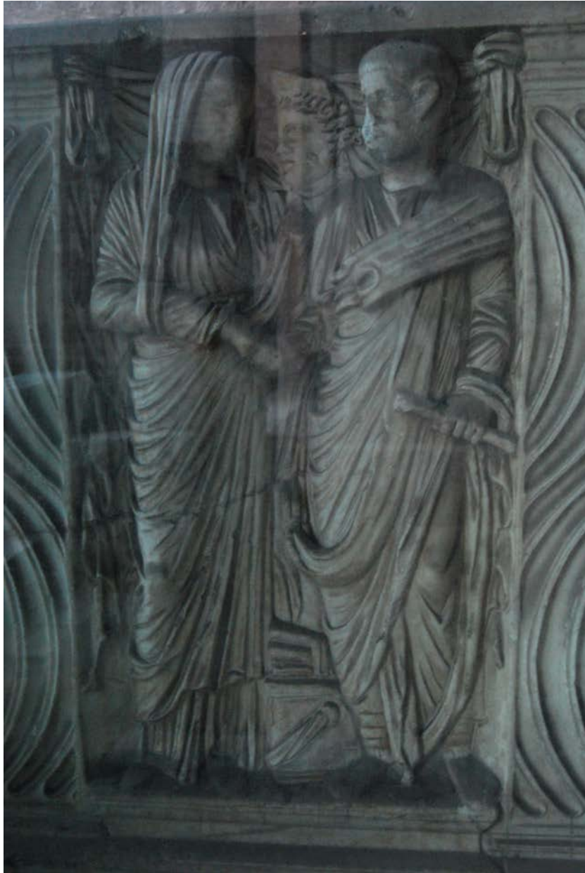
Figure 8: Roman sarcophagus from San Saba church, 3rd century, Rome.