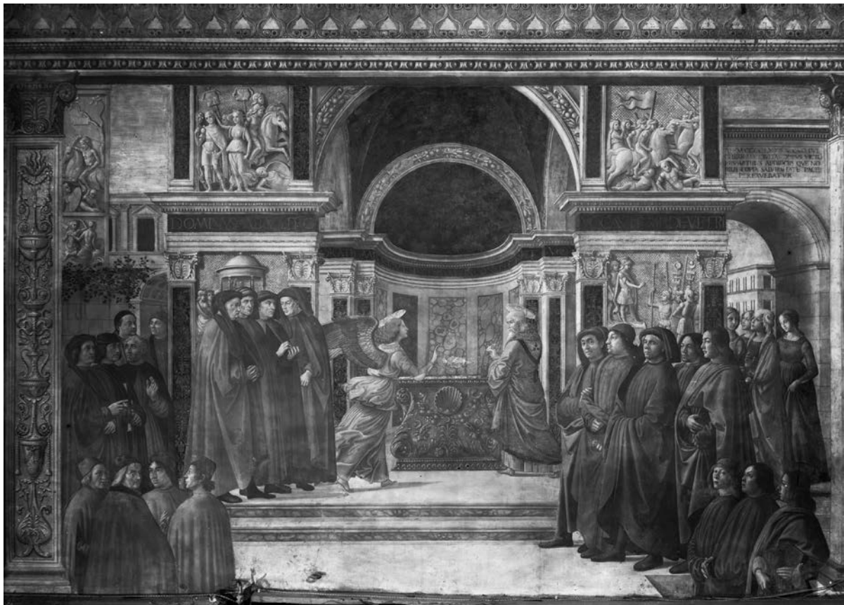
Figure 3: Domenico Ghirlandaio, The Annunciation to Zacharias, 1485-1490, Tornabuoni Chapel, Santa Maria Novella, Florence.