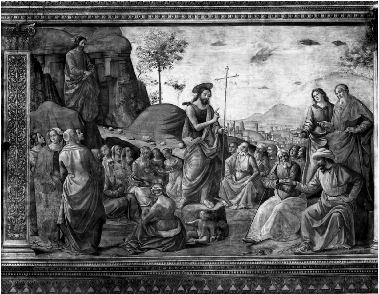
Figure 2: Domenico Ghirlandaio, The Preaching of St. John the Baptist, 1485-1490, Tornabuoni Chapel, Santa Maria Novella, Florence.