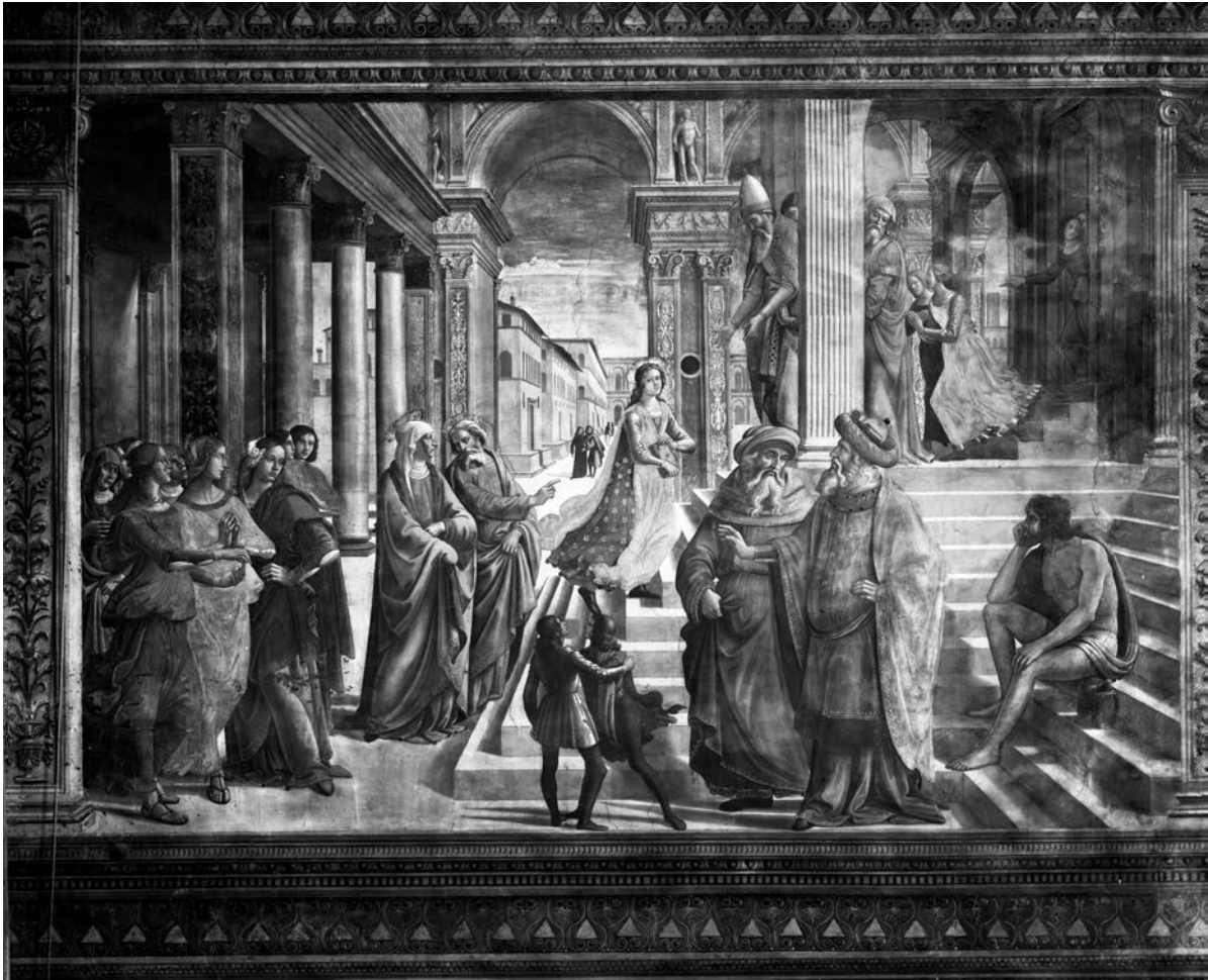
Figure 1: Domenico Ghirlandaio, The Presentation of the Virgin in the Temple, 1485-1490, Tornabuoni Chapel, Santa Maria Novella, Florence.