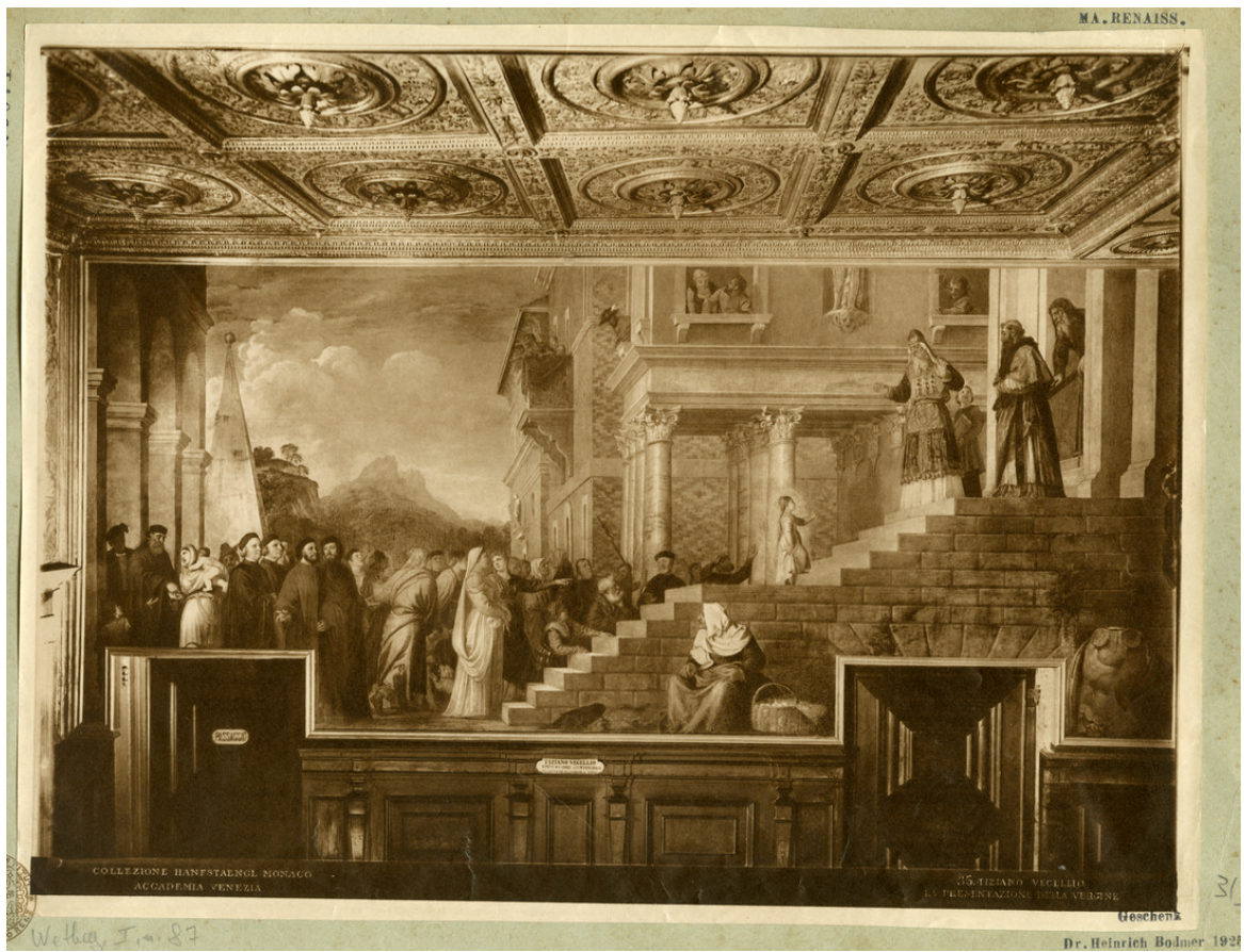
Figure 6: Tiziano Vecellio, The Presentation of the Virgin in the Temple , 1534-1538, Accademia Galleries, Venice.