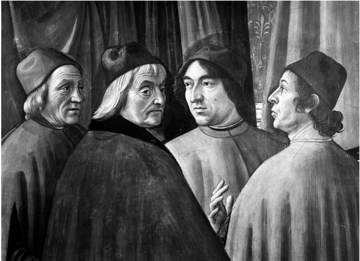
Figure 4: Domenico Ghirlandaio, The Annunciation to Zacharias , detail with portraits of Marsilio Ficino, Cristoforo Landino, Angelo Poliziano and Gentile Becchi, 1485-1490, Tornabuoni Chapel, Santa Maria Novella, Florence.