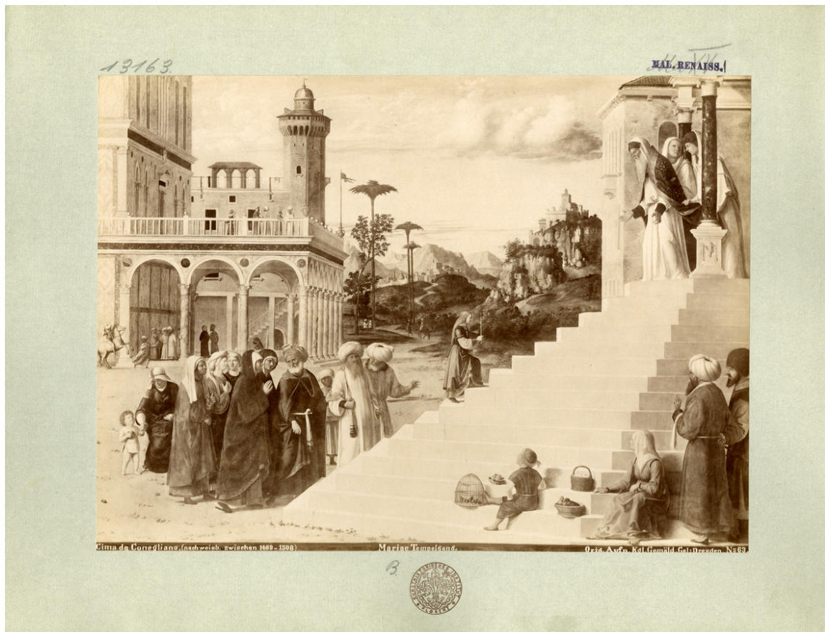
Figure 5: Cima da Conegliano, The Presentation of the Virgin in the Temple , 1496-1497, Gemäldegalerie Alte Meister, Dresden.