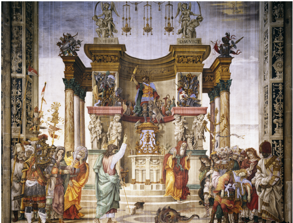
Figure 9: Filippino Lippi, St. Philip Driving the Dragon from the Temple of Hierapolis , 1494-1502, Strozzi Chapel, Santa Maria Novella, Florence.